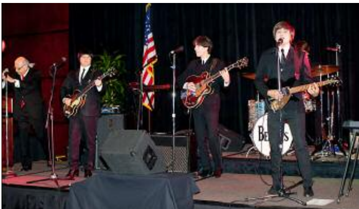
Entertainment "Ticket to Ride" A Beatles Tribute Band sponsored by Westfield Topanga and Promenade