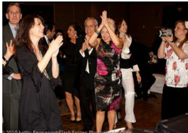
We love music