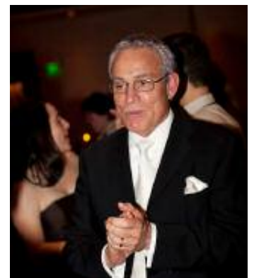
Dignified guy looks cool