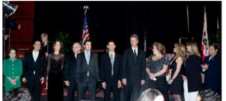
The Woodland Hills-Tarzana Chamber of Commerce Officers.